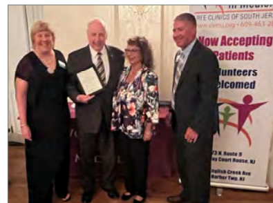
The County of Cape May 20 th Anniversary Community Partner

Your support ensures quality care for our neighbors in need. Please consider a donation today!