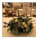
Garden Greenhouse & Nursery