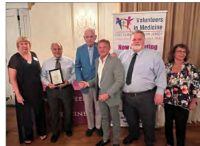
Foster Karney Foundation Community Partner of the Year