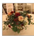
The Flower Company