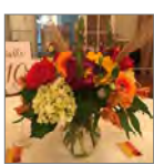
Marie's Flower Shoppe