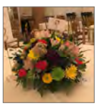
Country Barn Florist