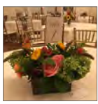
Blooms at the Country Greenery