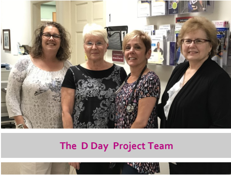
The D Day Project Team